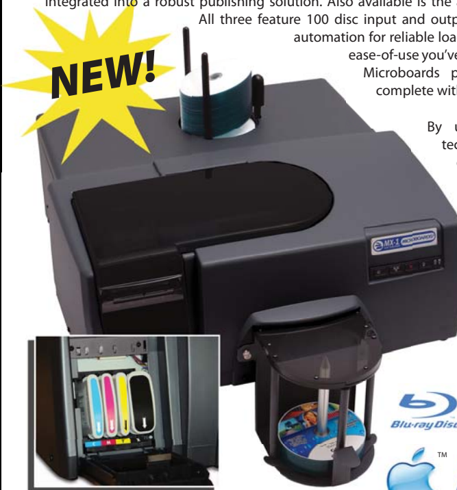
Inset: MX-1 with ink cartridge door open.