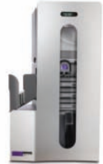
Producer III 8100